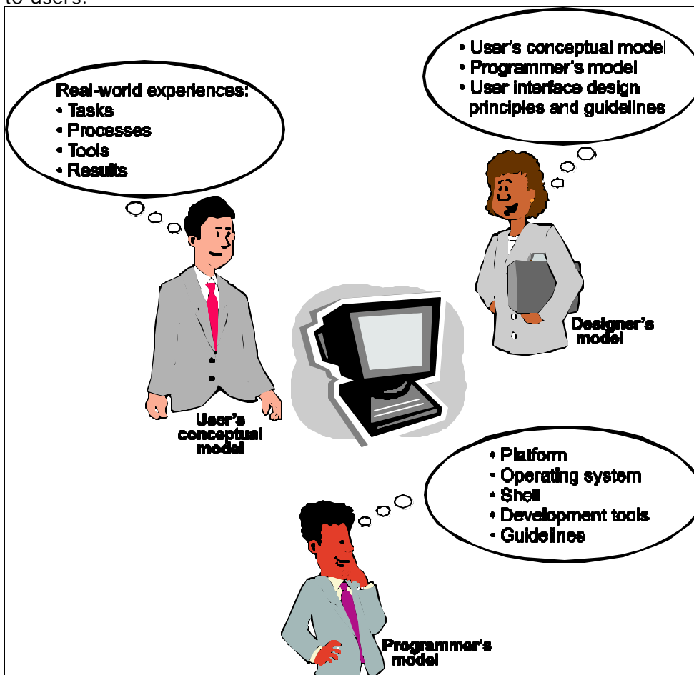
Figure 2: User interface models. (IBM, 1992)

The key concept is a focus on the user's point of view. This may seem like a simplistic approach or no more than common sense, but unfortunately the concept is still overlooked in much of today's product design and development. As a consultant, my livelihood is based on the reality that many executives and developers don't really focus on how people work or the jobs and tasks they perform. Rather, they focus on describing a product's functionality. The focus on the user's point of view reinforces the user interface models (Figure 2) defined in the early 1990s by IBM (1992) and further discussed by Mandel (1997). The user's conceptual model is internal and is based on his or her experiences, skills, and beliefs. The developer's model, on the other hand, is explicit and can be more formally defined. A product functionality point of view focuses on the hardware and software system, platform, tools, and specifications. This has little to do with the types of users and how they use a product. The designer's model is one of an architect or intermediary, representing the perspective of the users, who works with developers to ensure that, while the product will be functionally complete, it must also be usable and enjoyable to users.